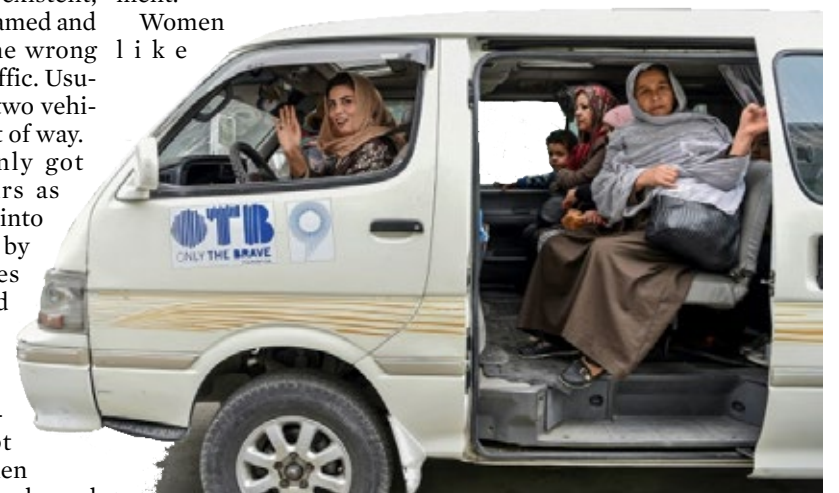
A first-of-its kind service called Pink Shuttle is helping women navigate the many challenges they face getting around Kabul, where a woeful lack of transport options is compounded by the risk of harassment if they walk on the streets