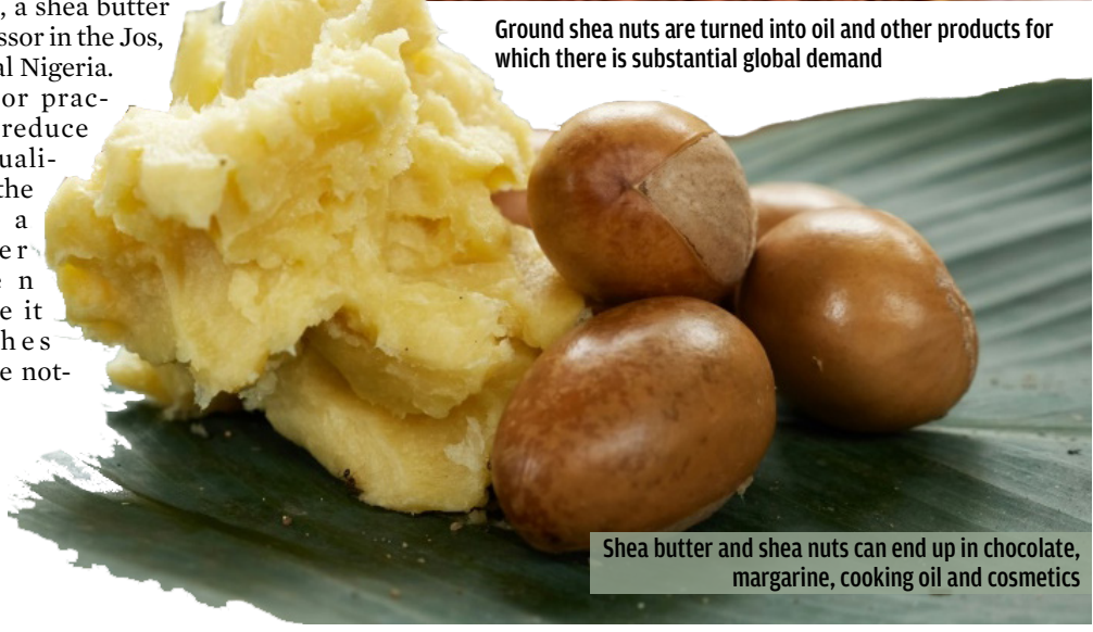
Shea butter and shea nuts can end up in chocolate, margarine, cooking oil and cosmetics