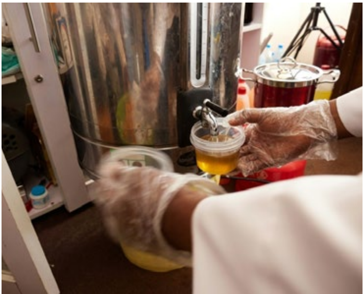
Nigerian producers of shea oil say that raising its quality is key to making it a major contributor to the nation's economy

"Poor practices reduce the quality of the shea butter even before it reaches us," he noted.