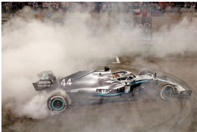
Lewis Hamilton of Britain celebrates after winning with a few doughnuts

The six-times world champion's success extended his points-scoring run to a re-