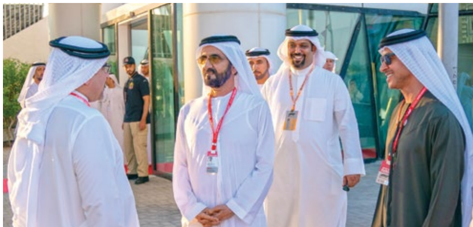
HRH the Crown Prince with HH Shaikh Mohammed bin Rashid Al Maktoum.

● HRH the Crown Prince noted that the Abu Dhabi Grand Prix provides an outstanding opportunity to experience the region's prestigious motorsports events.