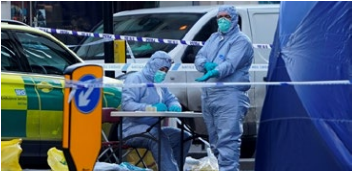
Khan, 28, was shot dead while wearing a fake explosives vest by police on London Bridge after a stabbing spree

Britain's Boris Johnson said yesterday the security services were stepping up monitoring of convicted terrorists released early from prison, as the London Bridge attack became embroiled in the election campaign. The prime minister revealed around 74 people with terrorist convictions had been released early from prison in a similar way to Usman Khan, who left jail last December and went on to stab two people to death in Friday's rampage. "They are being properly investigated to make sure there is no threat," Johnson told the BBC in an interview. "We've taken a lot of action as you can imagine in the last 48 hours," he said, adding he would not provide "operation details". Khan, 28, was shot dead while wearing a fake explosives vest by police on London Bridge after a stabbing spree that also injured three people launched at a nearby prisoner rehabilitation event he was attending. Members of the public were hailed as heroes for preventing even greater loss of life by tackling him -- one armed with a five-foot (1.5-metre) narwhal