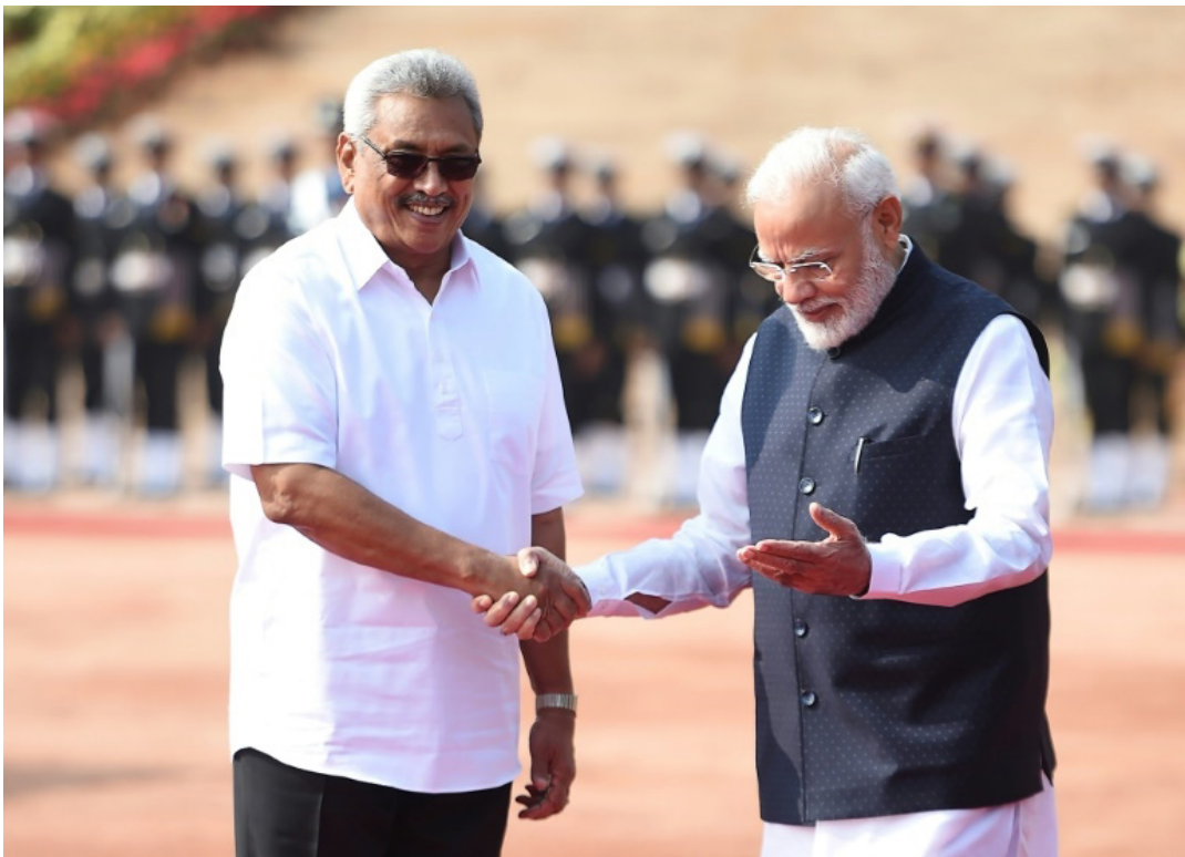
Sri Lanka’s new president Gotabaya Rajapaksa was in India this weekend on his first foreign trip since winning a presidential election on November 16

Sri Lanka’s new president Gotabaya Rajapaksa has warned India and Western nations that his country will be forced to seek finance from China again if they do not invest in the island. Rajapaksa told the Hindu newspaper in an interview published yesterday that other Asian nations would also turn to China’s giant Belt and Road infrastructure project without alternative help. Sri Lanka has traditionally been allied to India but became close to China, securing about $7 billion in loans and investment, when Rajapaksa’s brother Mahinda was president from 2005 to 2015. “I want to tell India, Japan, Singapore and Australia and other countries to also come and invest in us,” said the president, who was in India this weekend on his first foreign trip since winning a presidential election