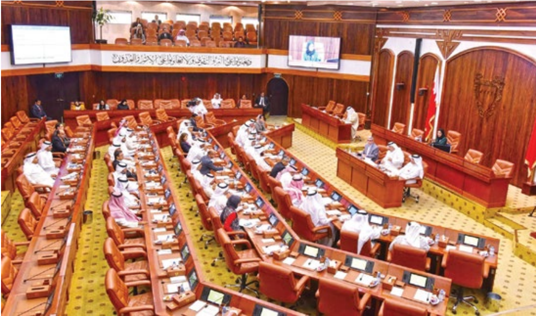
The House of Representatives in session.

She said: “The House of Representatives is obliged to pay the monthly remuneration and allowances stipulated in the decree-law on determining the allowances of the chairpersons, both deputy speakers and mem-