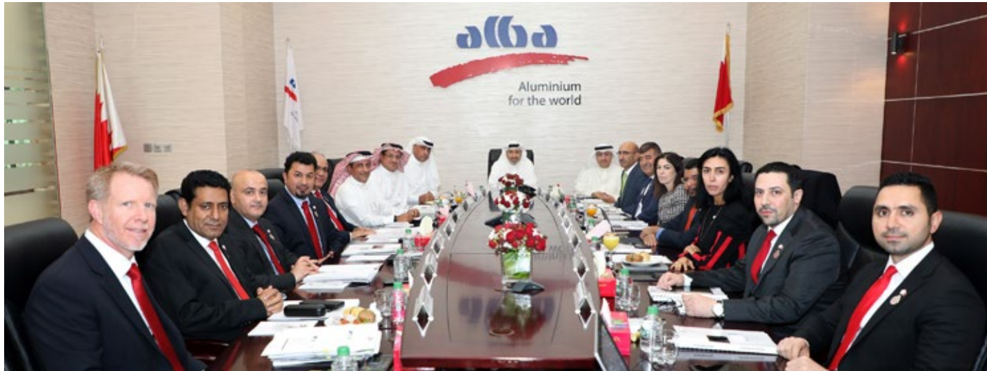
Alba's fourth quarterly board meeting