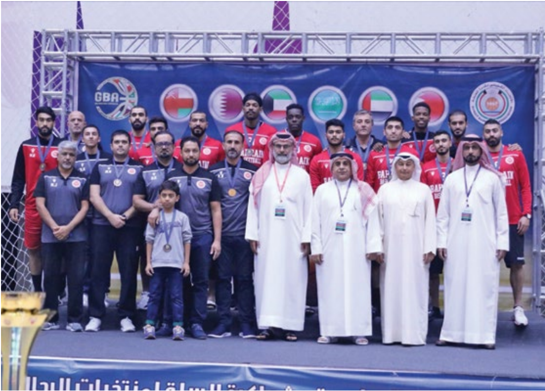
Bahrain team members with officials after receiving their bronze medals

Bahrain captured the bronze medals in the Gulf Basketball Association (GBA) Men's National Teams Championship 2019 last night following a well-deserved 76-67 victory over the UAE in the game for third place. The result ended a three-game losing streak in Kuwait City for the Bahrainis, who began the tournament with back-to-back wins before losing their next two games and then dropping out of title contention in the semi-finals. Claiming the gold medals last night were Saudi Arabia, who disappointed the home fans after defeating hosts Kuwait 92-83 in the final. Following both games, the top three squads were presented their respective medals in an awarding ceremony attended by GBA officials. Bahrain claimed their first major accolade under recently signed head coach Darko Russo. The nationals had a strong start against the Emiratis yesterday. They led 28-18 at the end of the first quarter but the Emiratis were able to narrow their deficit to 40-45 at the half.