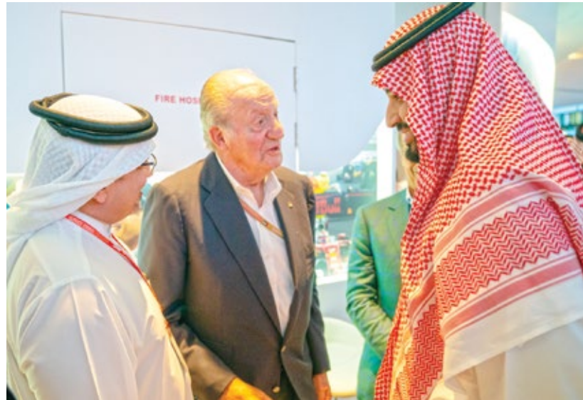
HRH the Crown Prince with HRH Prince Mohammed bin Salman bin Abdulaziz Al Saud.