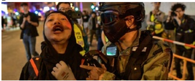
Skirmishes erupted overnight between protesters and police in Hong Kong after a rare period of calm in the city