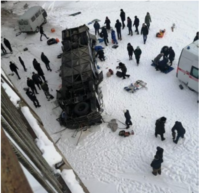
The aftermath of the tragic incident where a bus with 43 passengers and a driver plunged 22ft the Kuenga River in Transbaikial region of Siberia, 3,930 miles east of Moscow