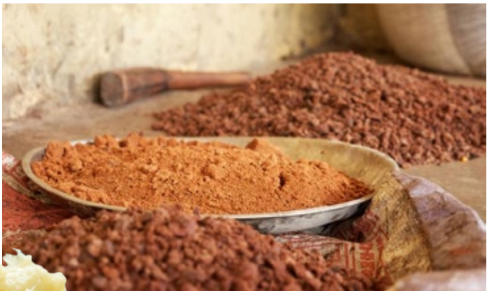
Ground shea nuts are turned into oil and other products for which there is substantial global demand