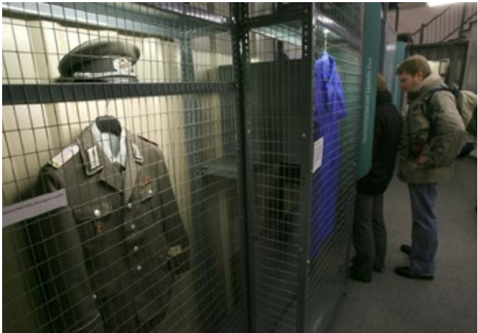
Burglers targeted the Stasi Museum in Berlin, stealing medals and jewellery, police said

fell from a bridge into the Kuenga river at around 0938 Moscow time (0638 GMT). It said about 43 passengers and a driver were on the bus. A police spokeswoman told Russia-24 TV that the cause of the accident was being investigated. Russia's record on road safety is one of the worst in the world. According to the country's traffic police, 18,214 people died in road accidents last year. That is more than the 15,000 Soviet servicemen who were killed during the whole of the Soviet war in Afghanistan in 1979-1989.