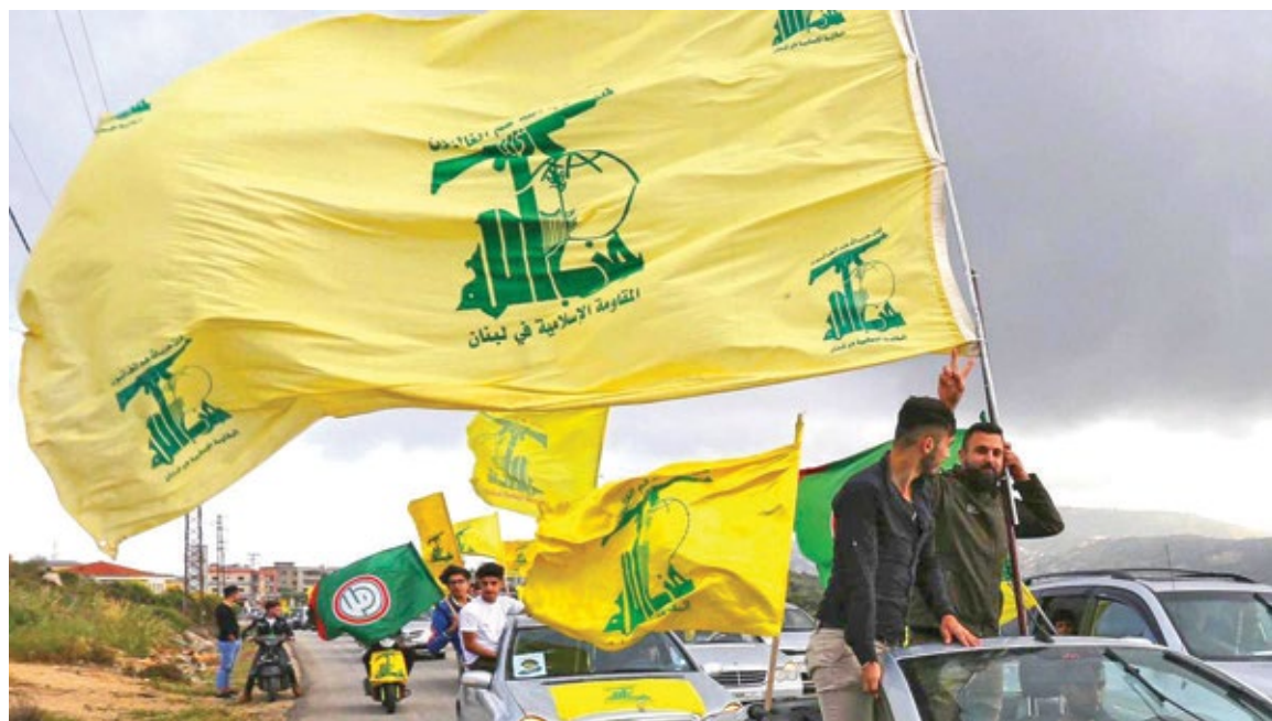
Hizbollah's activities could be banned across Europe.

For 18 months, US ambassador to Berlin Richard Grenell sought to persuade European states to adopt the American perspective on Iranian and Hezbollah activities; the new policy in Germany bears his hallmarks. Iran will undoubtedly be furious. The leadership in Tehran spared no effort in convincing the Europeans to push for exemptions from US sanctions but has since been steadily let down as European banks and businesses refused to deal with the regime, fearing they too would be sanctioned. The Iranians have used a combination of blackmail and threats, and a pattern of escalation and de-escalation, aware that a US-European alliance would further increase their isolation. Meanwhile, as protests rage on home turf, sources say the regime in Tehran is determined to reject any dialogue with