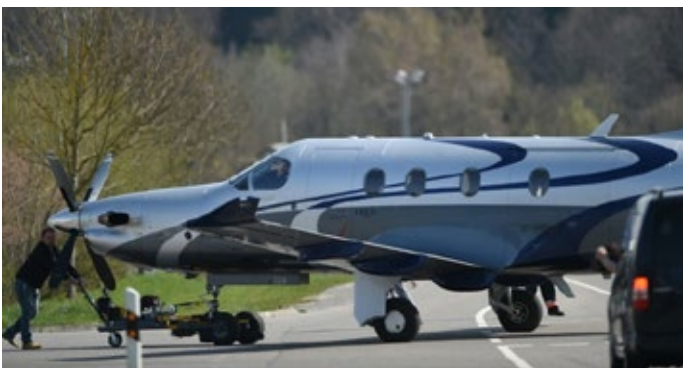
A file picture shows a Pilatus PC-12 single-engined aircraft similar to the one involved in the crash, in which nine people were killed

were en route to the crash site and that the National Transportation Safety Board (NTSB) would be in charge of the investigation.