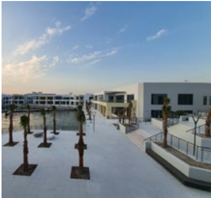
Sa'ada Waterfront in its current phase

Naseef Café, will open its doors to the new branch during launch