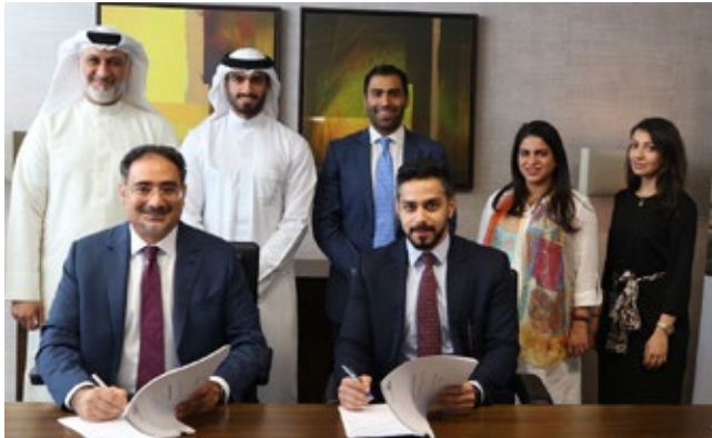
Key Representatives from Edamah and CrossFit Muharraq

The Sa'ada project, endorsed by HRH Prince Khalifa bin Salman Al Khalifa the Prime Minister of the Kingdom of Bahrain, is expected to launch soon. The first tenant of the project,