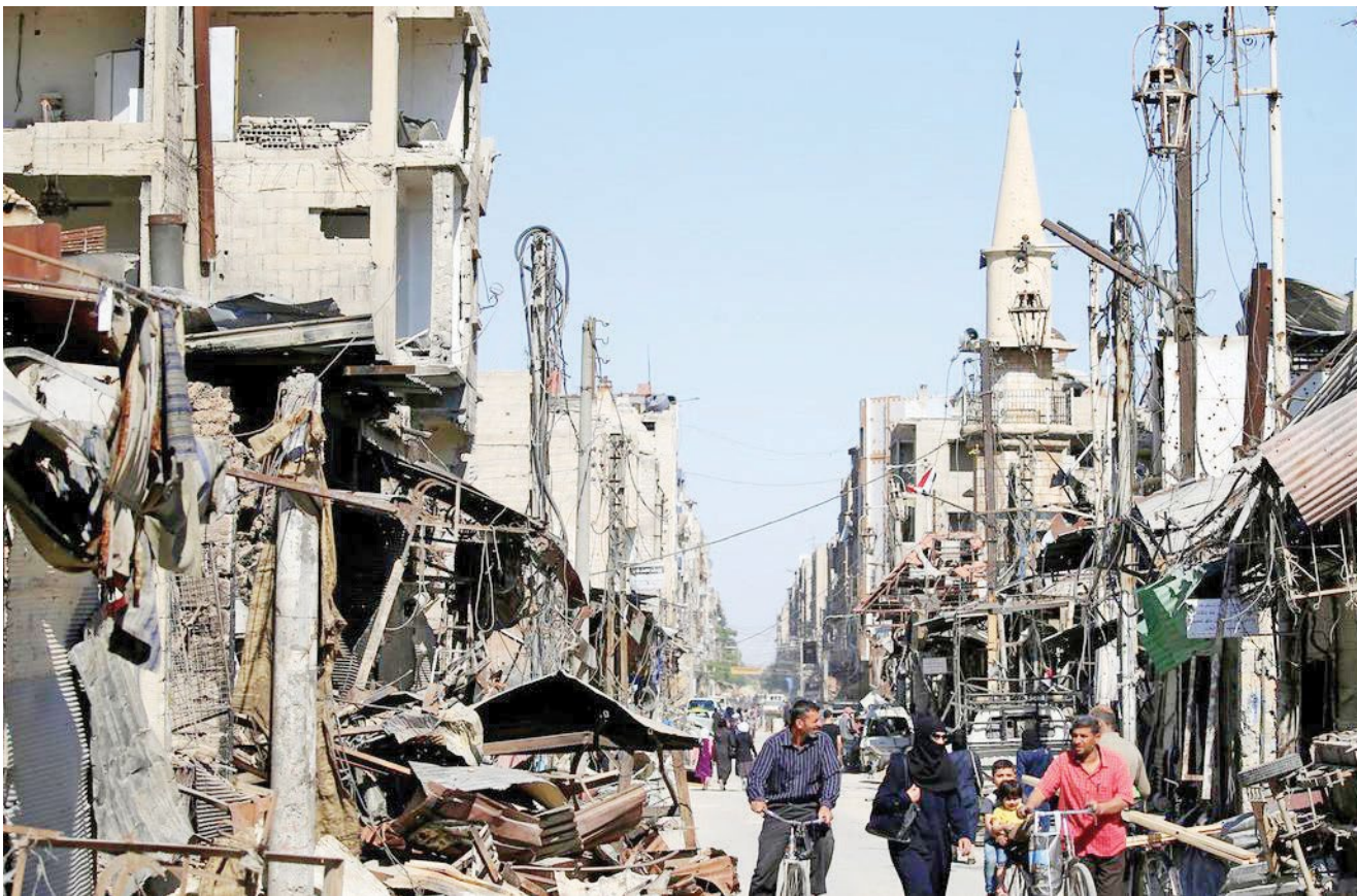
A street in Douma near Damascus devastated by the Syria war.

The regime shot them down. "Since the beginning of the second round, we made five proposals