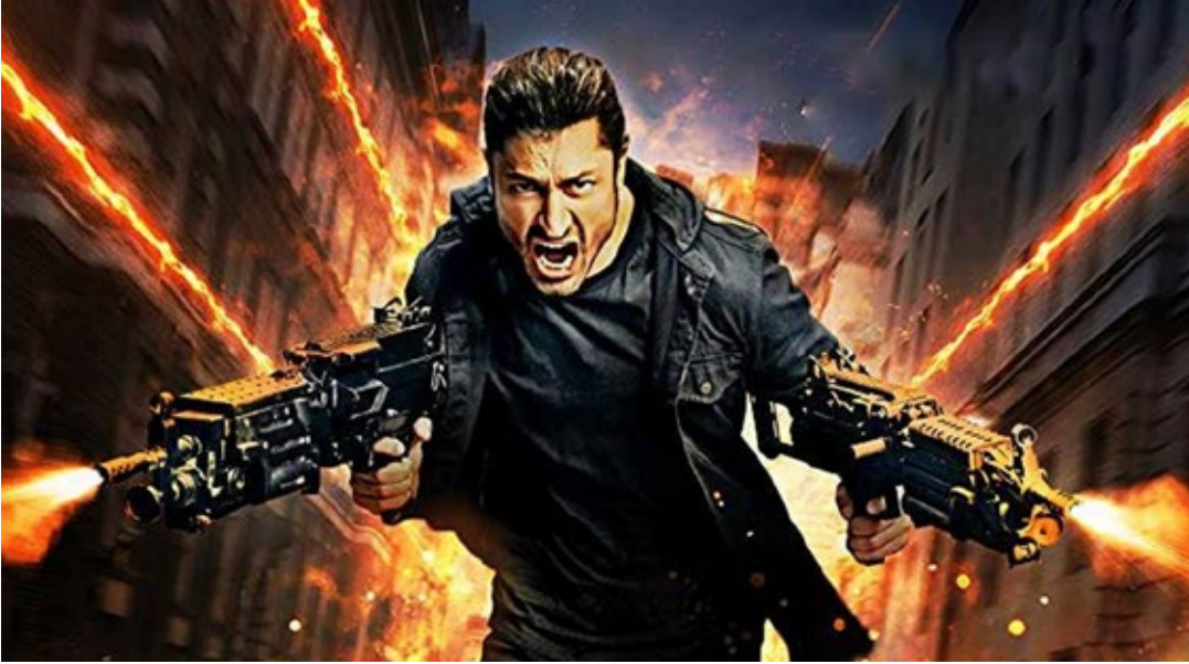
A scene from 'Commando 3'

Despite his elegant glides and save, the film suffers abundantly from sheer lack of imagination. Even its eclectic ensemble of actors -Adah Sharma (Bhavna Reddy), Angira Dhar (Mallika Sood) and Gulshan Devaiah