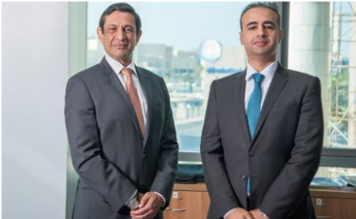
Officials during the launch

In a first, AUB said eMyHassad eliminates the need to download an app to purchase certificates as application and purchase can all be completed on a browser. The application allows instant payment for MyHassad certifi-