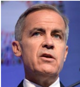
Governor of the Bank of England Mark Joseph Carney