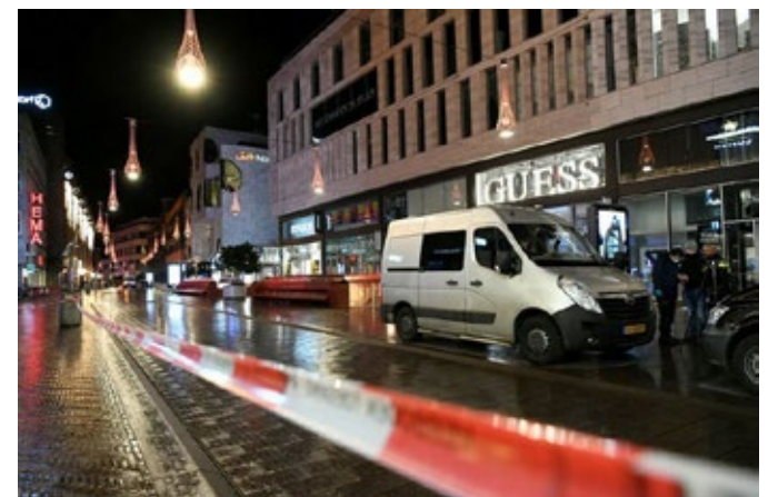
Stabbing in Netherlands