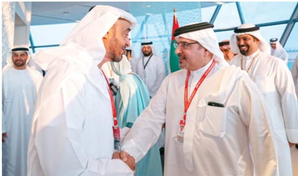
HRH the Crown Prince being received by HH Shaikh Mohamed bin Zayed Al Nahyan at Yas Marina Circuit.