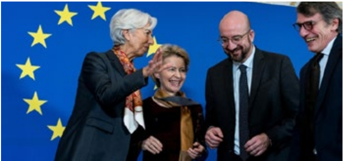
(From L) President of the European Central Bank (ECB) Christine Lagard attends the launch of the EU’s new leadership team: European Commission President-elect Ursula von der Leyen, European Council President Charles Michel, and European Parliament president David Sassoli